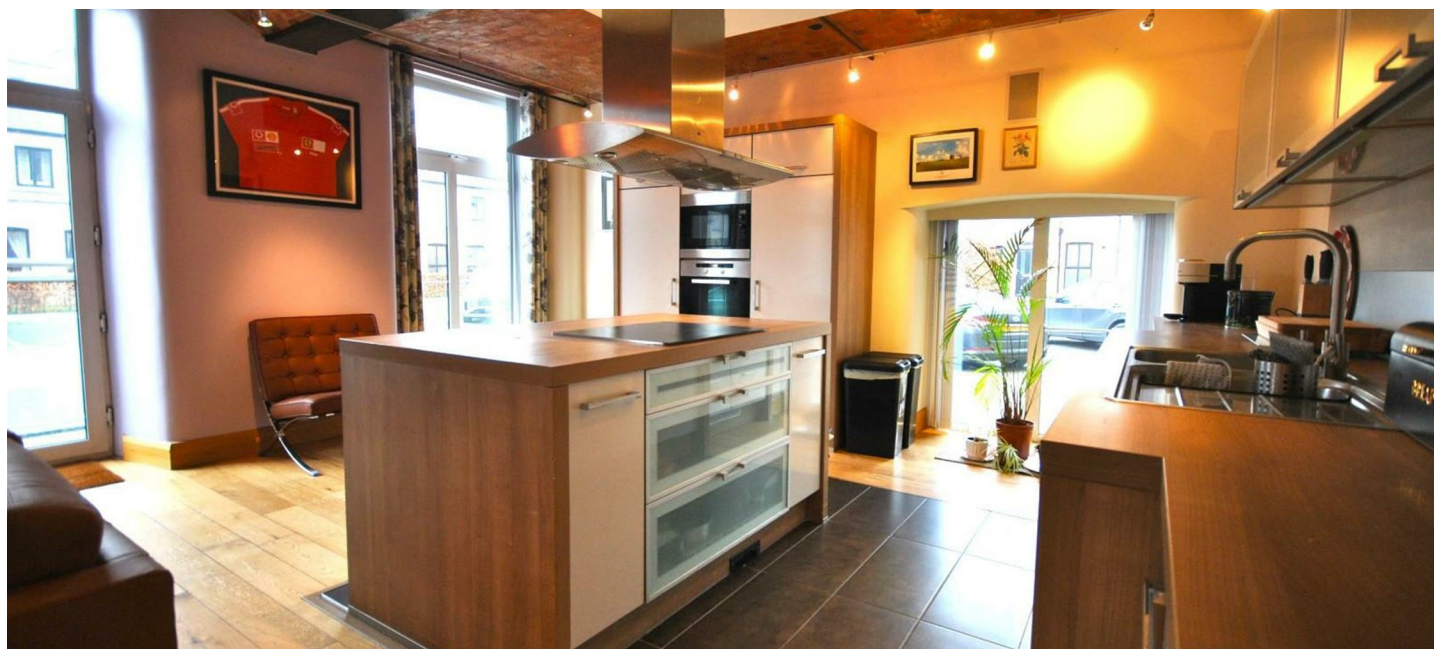
1 The Flax House, The Mill Village, Newtownards, BT23 5WT