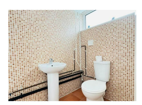
16 Steeple Green Stiles Way, Antrim, BT41 1BP