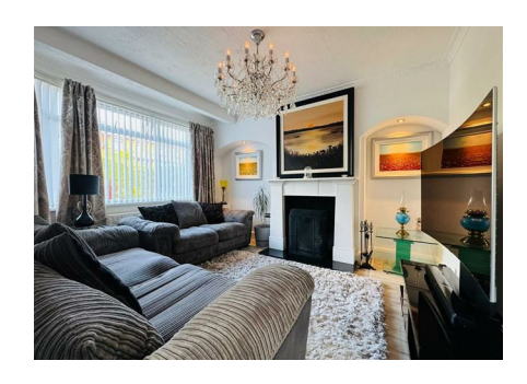
120 Serpentine Road Whitewell Road, Newtownabbey, BT36 7JG