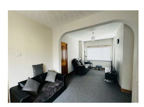
165 Shore Road Whitehouse, Newtownabbey, BT37 9SZ