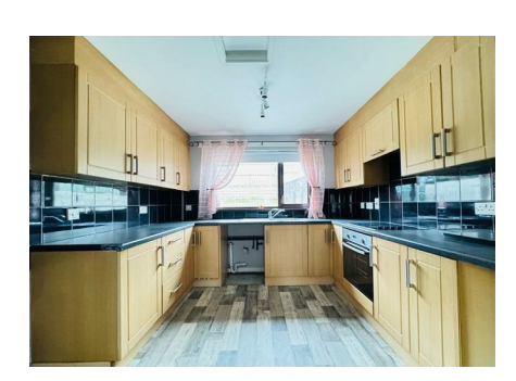
31 The Glade Mossley, Newtownabbey, BT36 5NN