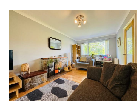
14 Glencree Park Jordanstown, Newtownabbey, BT37 0QS