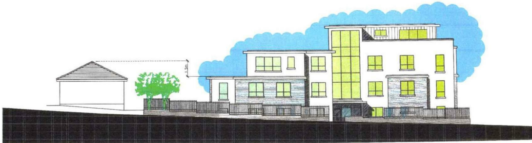
Georges Street View