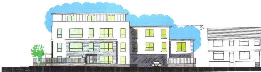
Upper Greenwell Street View