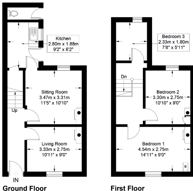
Illustration for identification purposes only, measurements are approximate, not to scale. Fourlabs.co © (ID1260319)