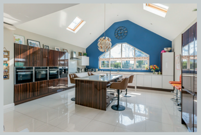
DINING AREA 19' 0" x 12' 8" (5.79m x 3.86m) At widest points. Polished tiled floor, upvc double glazed sliding doors to rear patio.