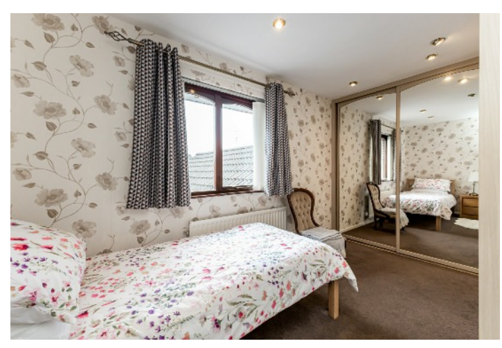
BEDROOM (2): 11' 5" x 8' 3" (3.48m x 2.51m) (at widest points). Outlook to front.