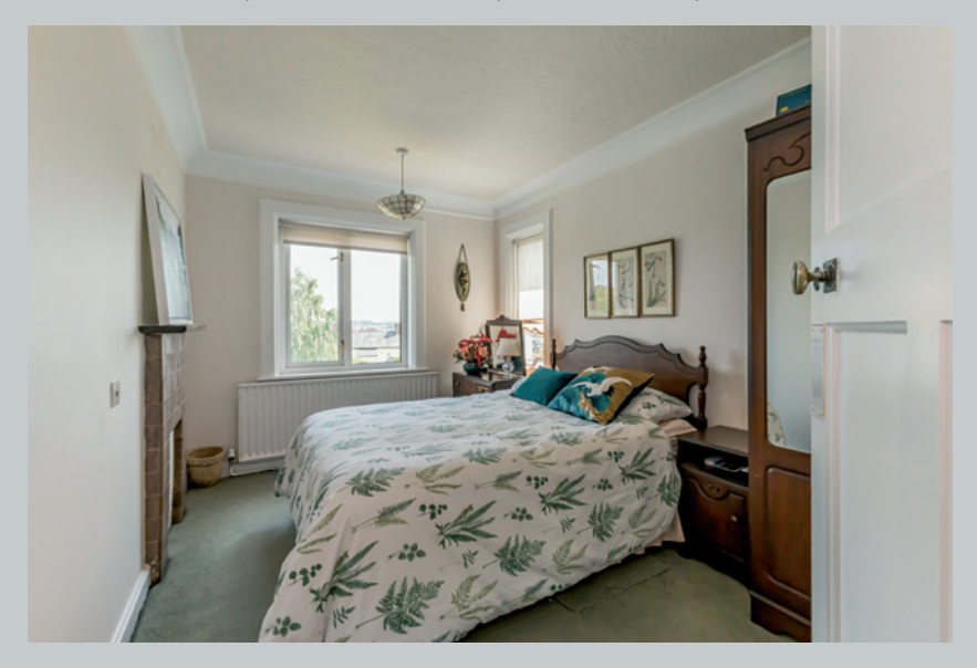
BEDROOM (4): 11' 6" x 9' 5" (3.51m x 2.87m) Feature fireplace, tiled surround.

BEDROOM (3): 14' 2" x 9' 5" (4.32m x 2.87m) Feature fireplace, tiled surround.