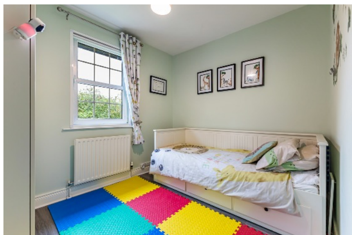
BEDROOM (4): 8' 10" x 7' 1" (2.69m x 2.16m) Currently used as an office.