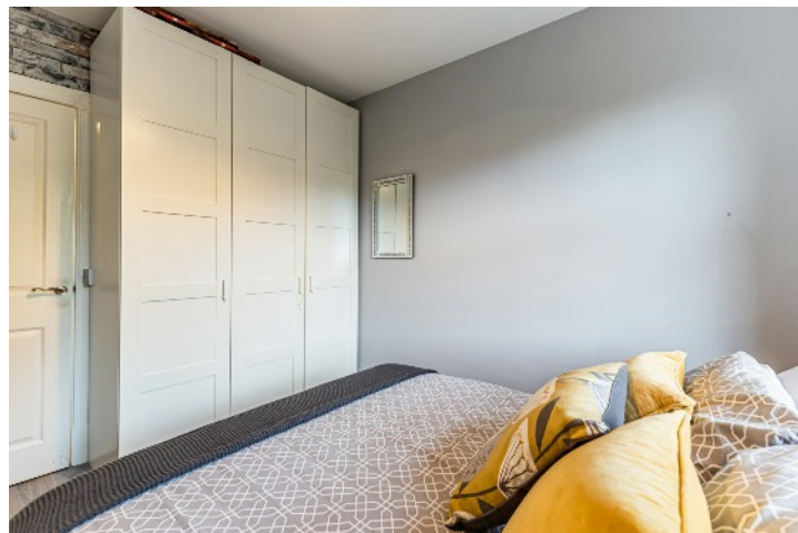
BEDROOM (3): 11' 7" x 8' 1" (3.53m x 2.46m)