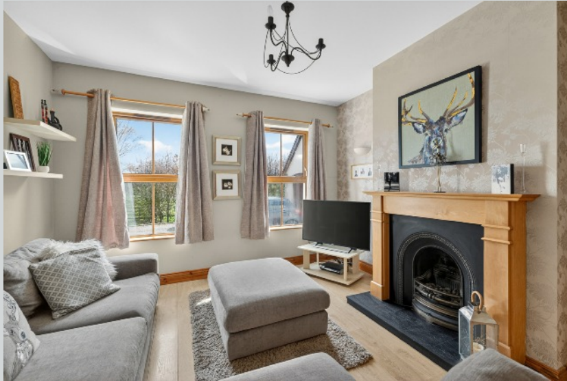
DRAWING ROOM: 24' 0" x 14' 1" (7.32m x 4.29m) Feature fireplace with open fire, cornicing and picture rail.