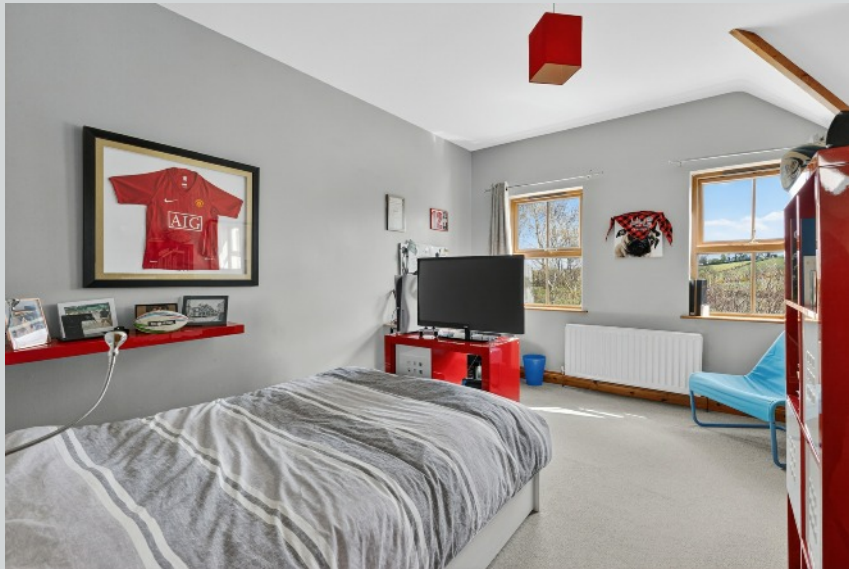
BEDROOM (4): 13' 9" x 11' 10" (4.19m x 3.61m)