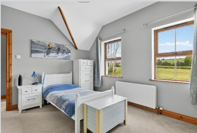
BEDROOM (5)/OFFICE/DRESSING ROOM: 11' 10" x 8' 10" (3.61m x 2.69m) Velux window.