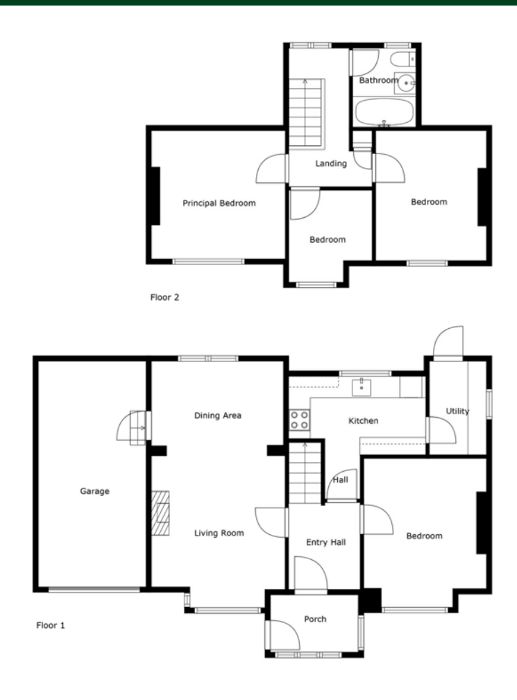
Sizes And Dimensions Are Approximate. Actual May Vary.