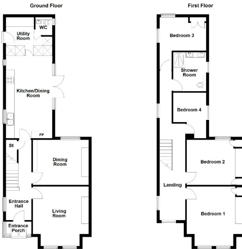
2 Sandford Avenue, Belfast

Travelling out of Ballyhackamore towards the city centre, turn left onto North Road and take the first right onto Cyprus Avenue. Sandford Avenue is the second turn on the left and the property is on the left hand side.