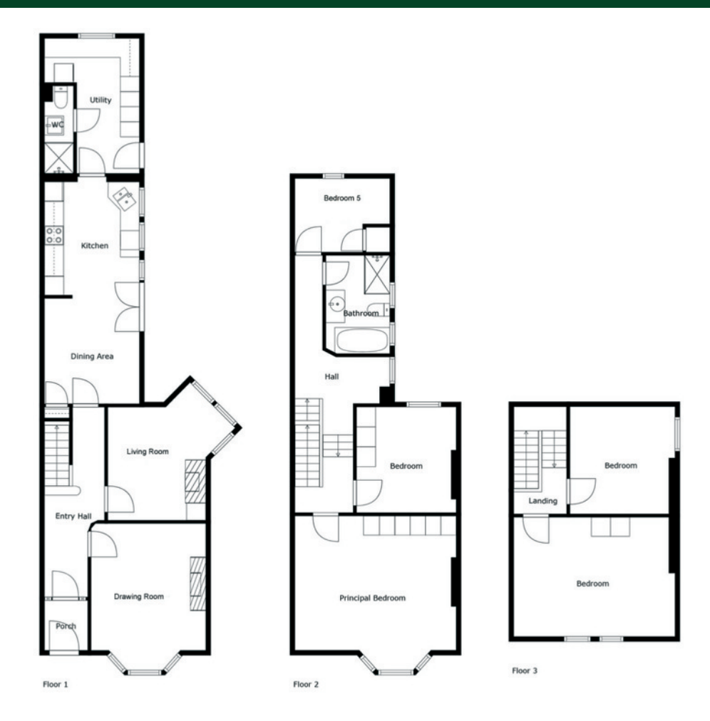
Sizes And Dimensions Are Approximate. Actual May Vary.