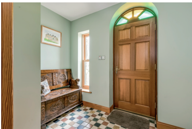
SPACIOUS RECEPTION HALL: Leading to dining room.