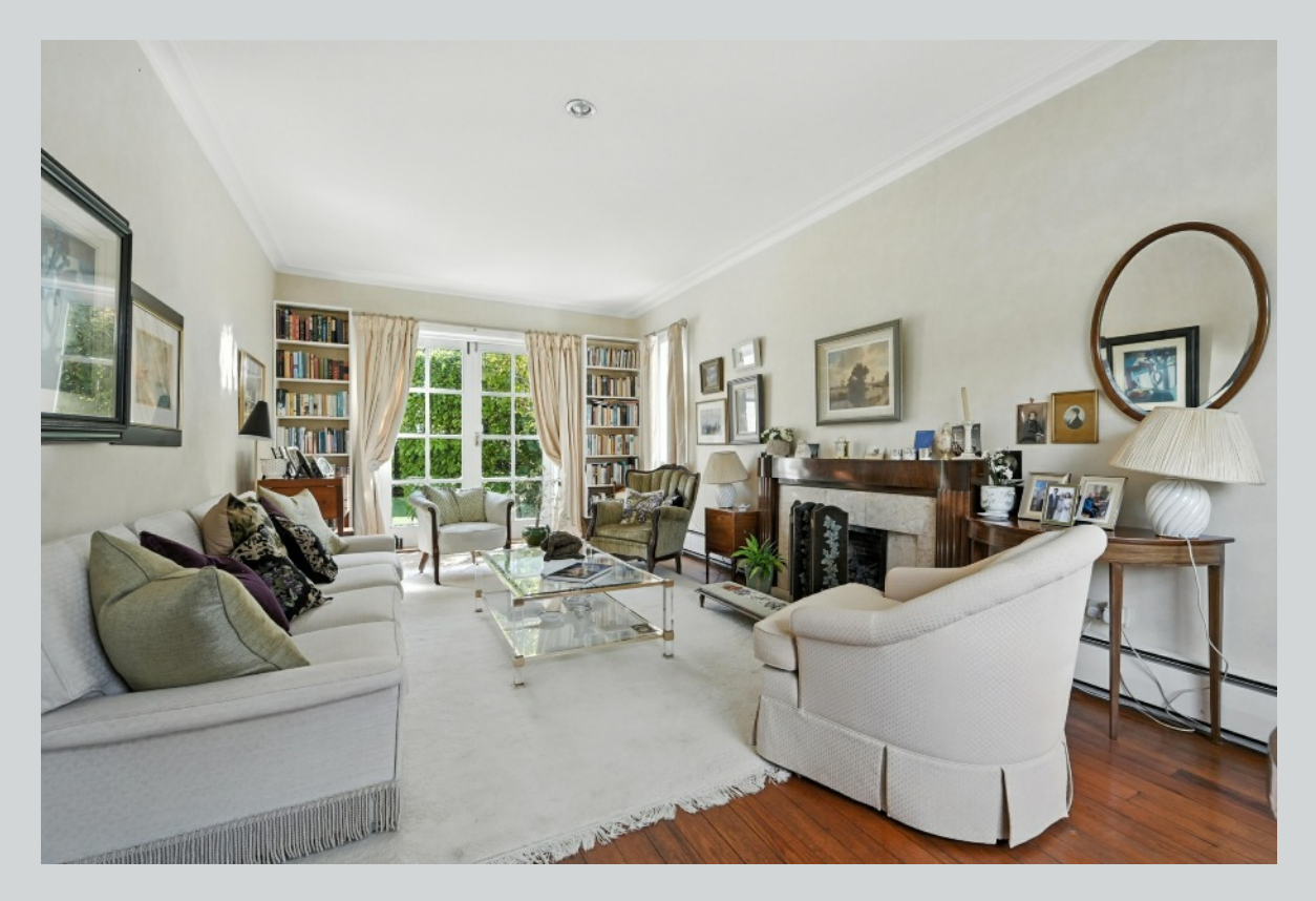
FAMILY ROOM: 12' 9" x 12' 4" (3.89m x 3.76m) Built-in shelving and cupboards, outlook to front, cornice ceiling.

DRAWING ROOM: 24' 4" \times 11' 10" (7.42m \times 3.61m) Pine wooden floor, mahogany surround fireplace with marble inset and hearth and gas coal effect fire, dual aspect windows, glazed double doors to rear garden, cornice ceiling.