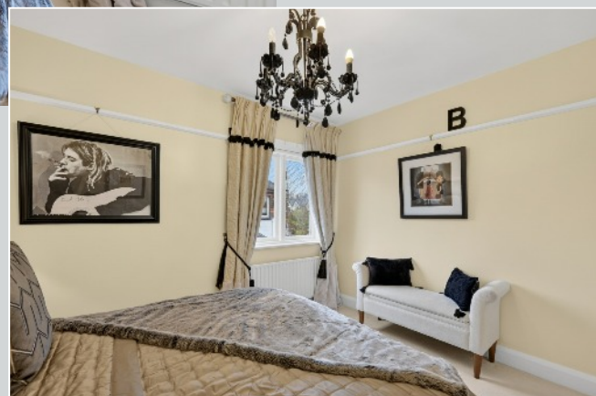
BEDROOM (5)/DRESSING ROOM/HOME OFFICE: 9' 3" x 9' 2" (2.82m x 2.79m) (at widest points). Built-in wardrobes, drawers and desk.