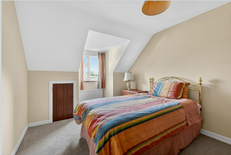
BEDROOM (5): 14' 1" x 11' 5" (4.29m x 3.48m) Outlook to front.