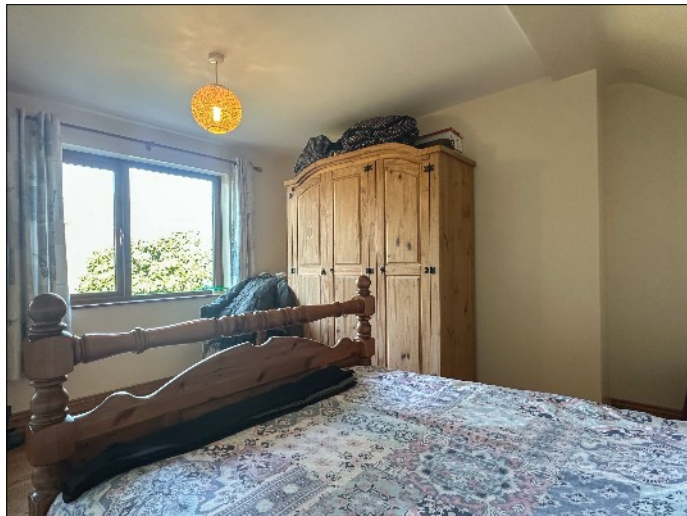
Bedroom 1: 13' 3" X 10' 1" (4.05m X 3.07m) with access to eaves.