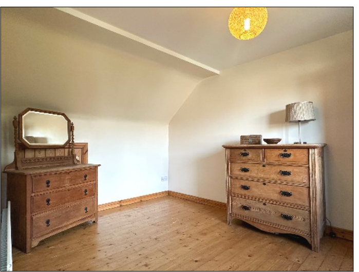
Bedroom 2: 13' 3" X 8' 2" (4.05m X 2.5m)with access to eaves.