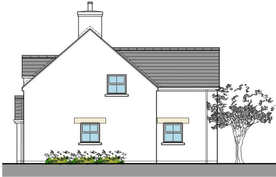
ELEVATION TO EXISTING LANEWAY