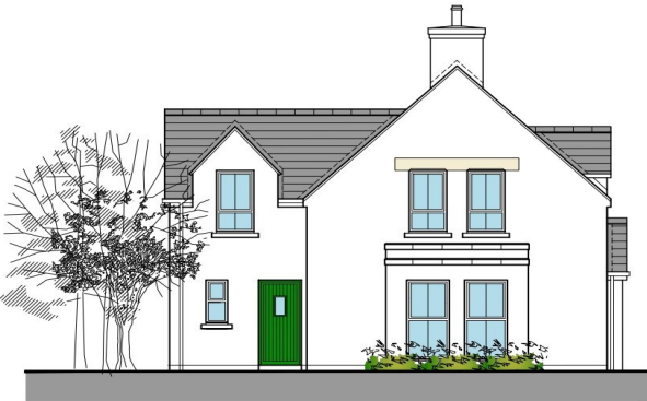
ELEVATION TO WHITEPARK ROAD