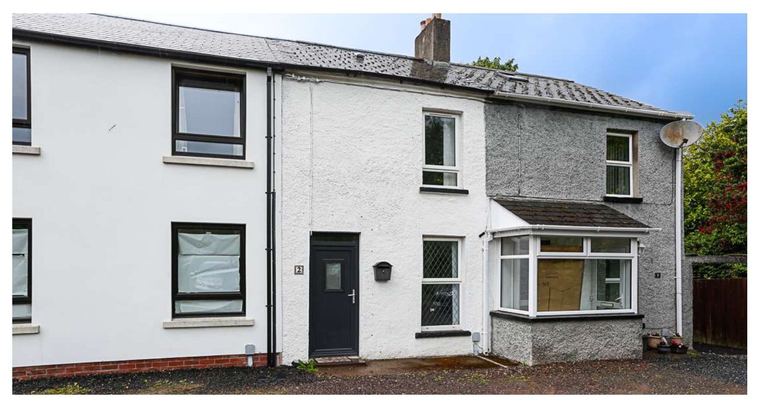
MID TERRACE | 2 ⊨ | 1 ≒ | 1 ⊟

Quarry Cottages is a delightful mid-terrace property offering two well-sized bedrooms, making it a perfect option for first-time buyers looking to get onto the property ladder or investors seeking a reliable rental opportunity