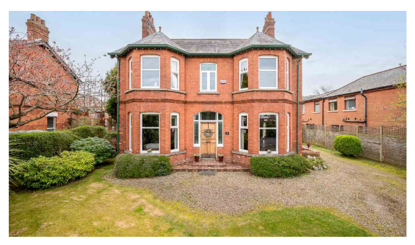
DETACHED | 4 ⊨ | 1 ≒ | 3 ⊟

Nestled in one of Holywood's most desirable avenues, 22 Ardlee Avenue is a striking red-brick, double-fronted detached home that has been cherished as a family residence for many years.