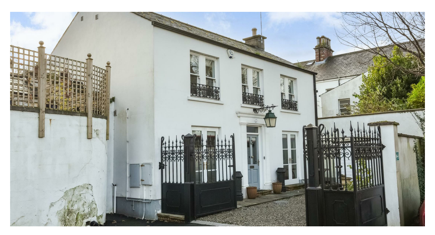
HOUSE -DETACHED Add text here