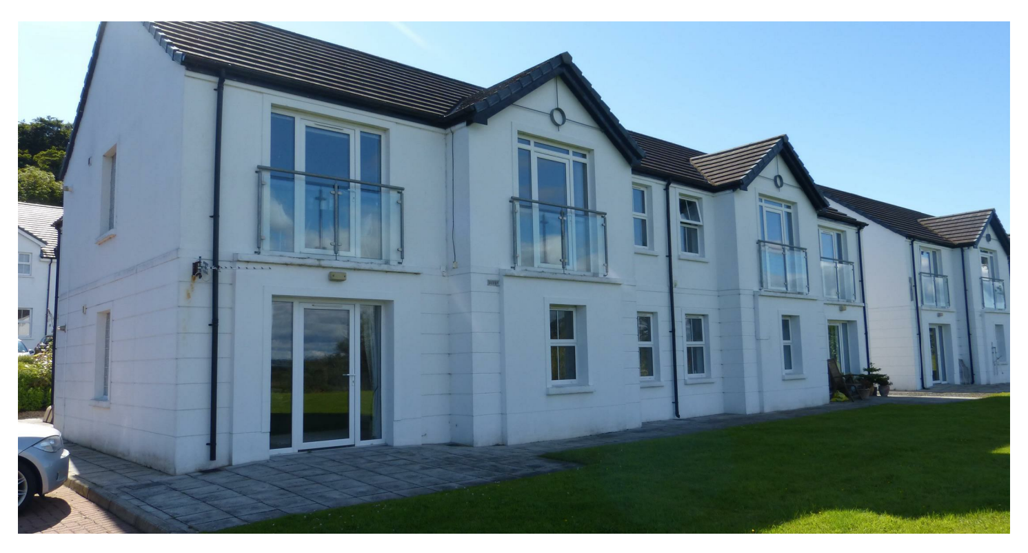
APARTMENT | 2 ⊨ | N € | 1 ⊟