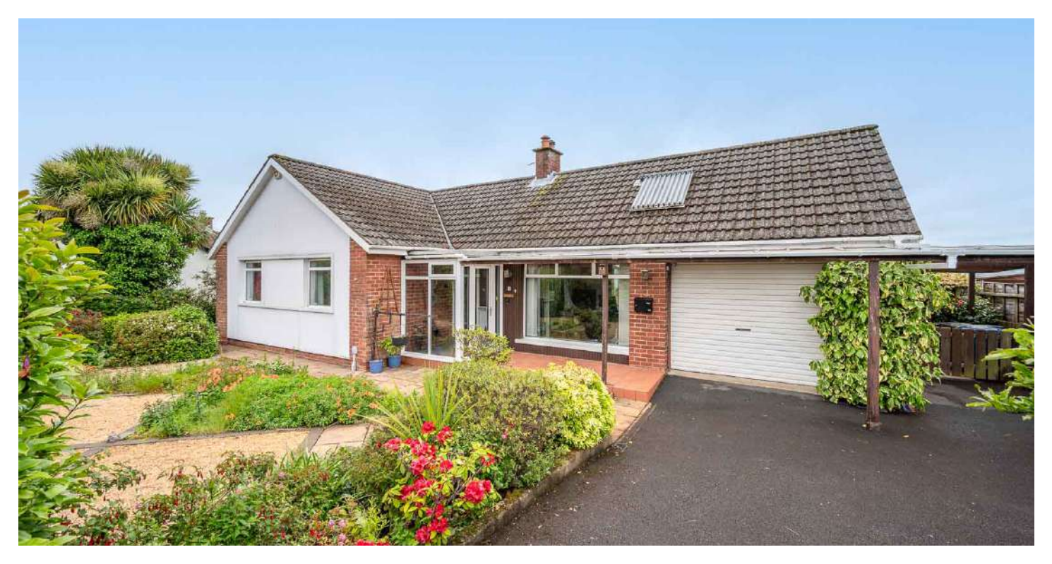
DETACHED BUNGALOW | 3 ⊨ | 1 ≒ | 2 ⊟

4 Rathmoyle Park is a beautifully presented detached bungalow set in a quiet cul-de-sac within the highly sought-after Seahill area of Holywood. This exceptional home offers a rare combination of a peaceful coastal lifestyle