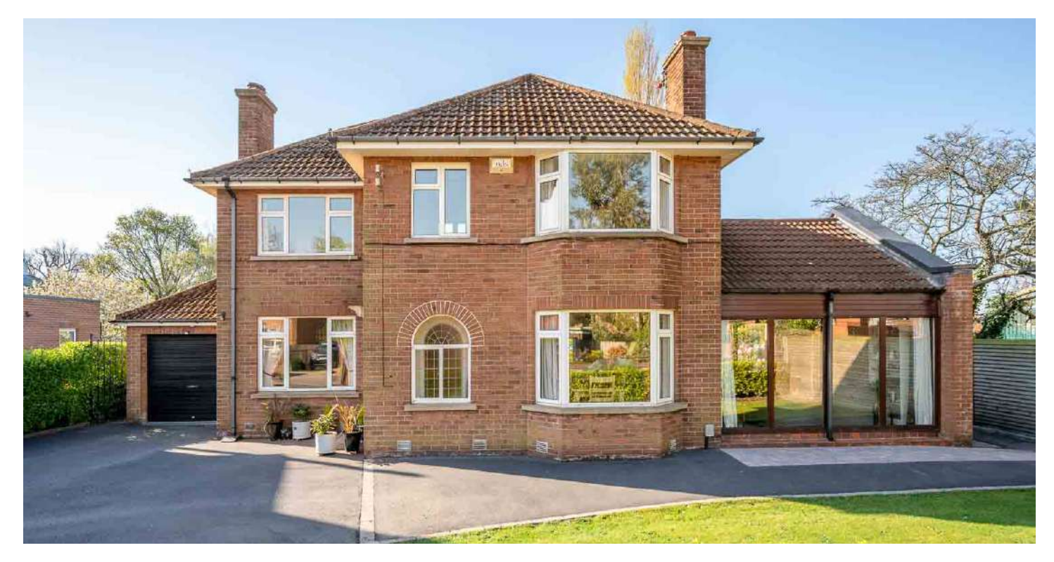
DETACHED | 4 ⊨ | 3 ≒ | 4 ⊟