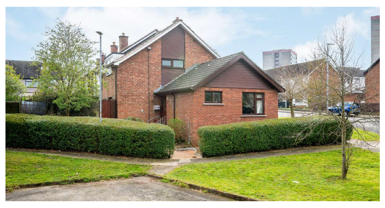
END TERRACE | 3 ⊨ | 2 ≒ | 2 ⊟

We are delighted to bring to the market this deceptively spacious end-terrace property located in the ever-popular Belvoir Area of South Belfast.