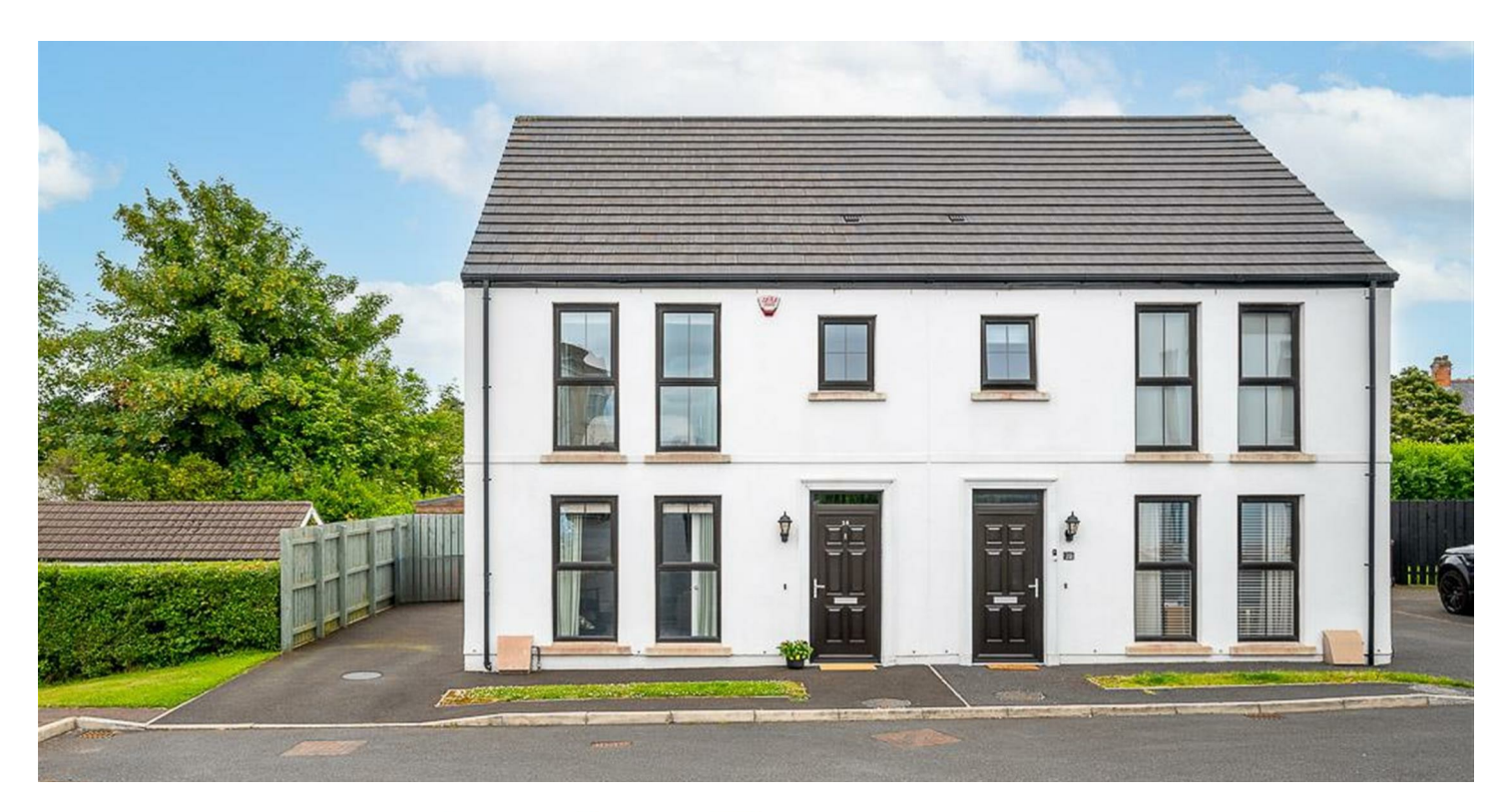
HOUSE - SEMI-DETACHED Add text here