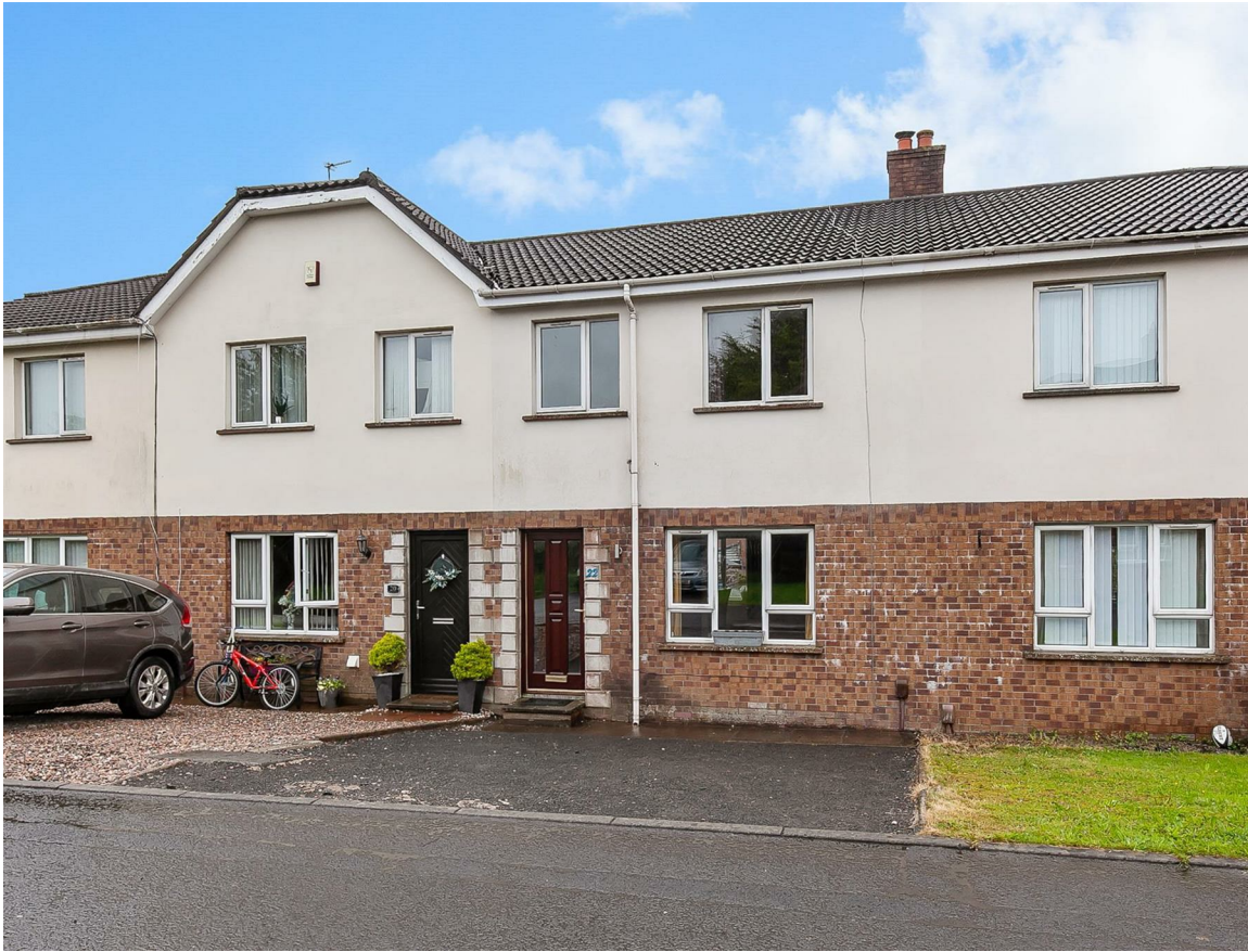
22 Abbeycroft Drive, Newtownabbey, BT37 0YJ