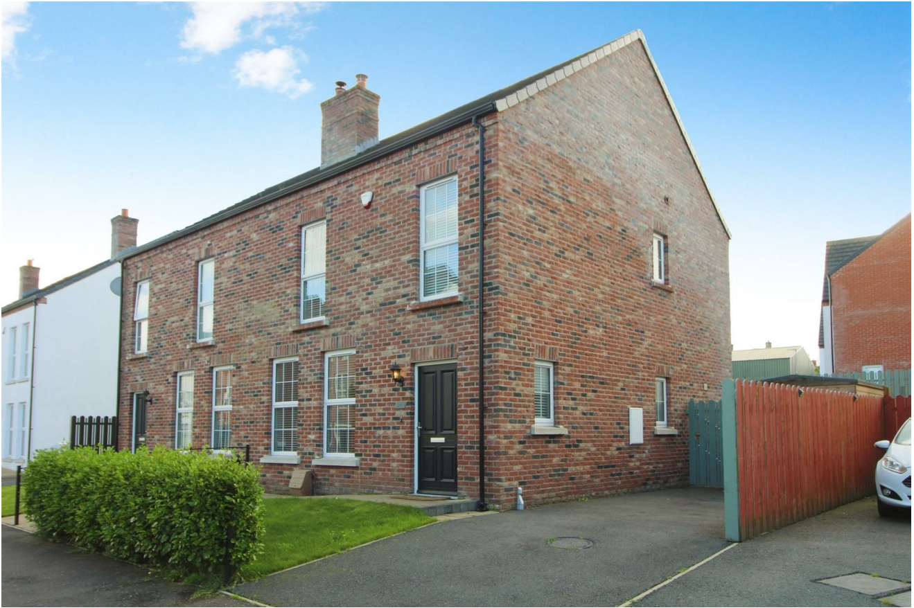
18 Blackrock Row, Newtownabbey, BT36 4AD