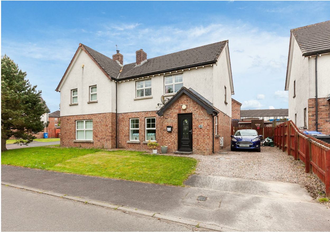
25 Lindara Drive, Larne, BT40 2FB