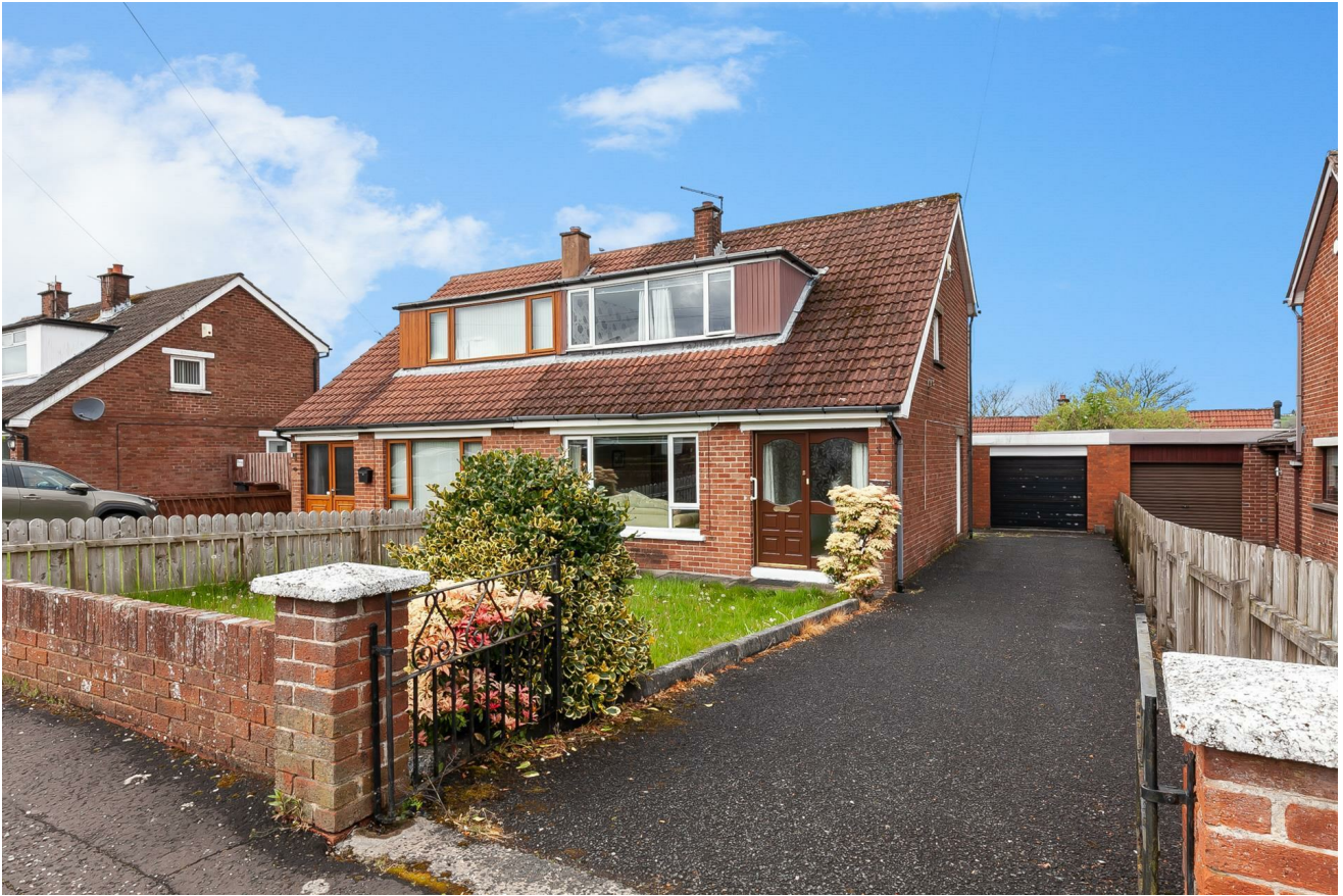
21 Fairview Way, Newtownabbey, BT36 6PX