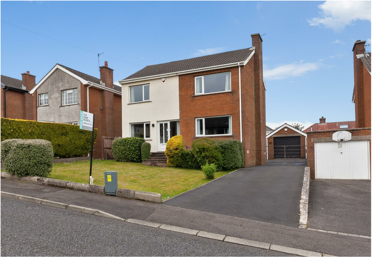
15 Vaddegan Avenue, Newtownabbey, BT36 7SP