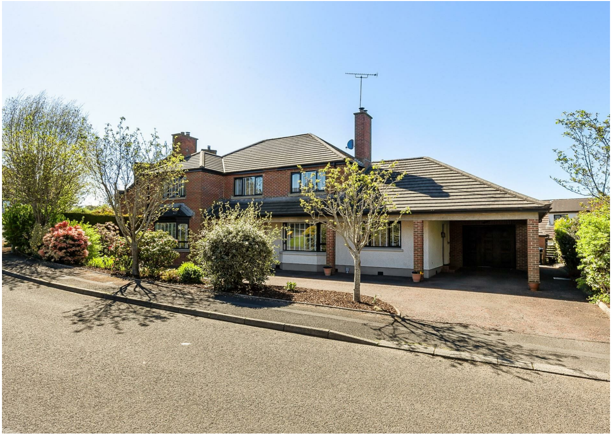
30 Lylehill Green, Templepatrick, BT39 0BF