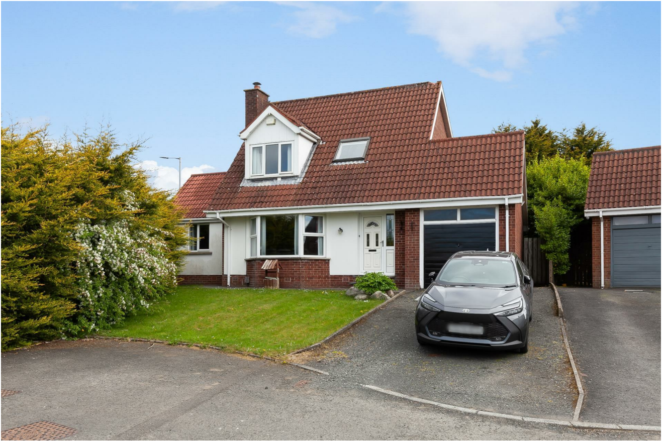
11 Hillview Green, Carrickfergus, BT38 8YX