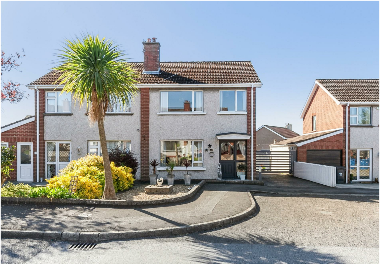
12 Greenland Grove, Larne, BT40 1DP