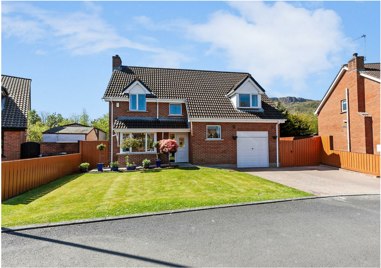
65 Arthur Avenue, Newtownabbey, BT36 7EJ