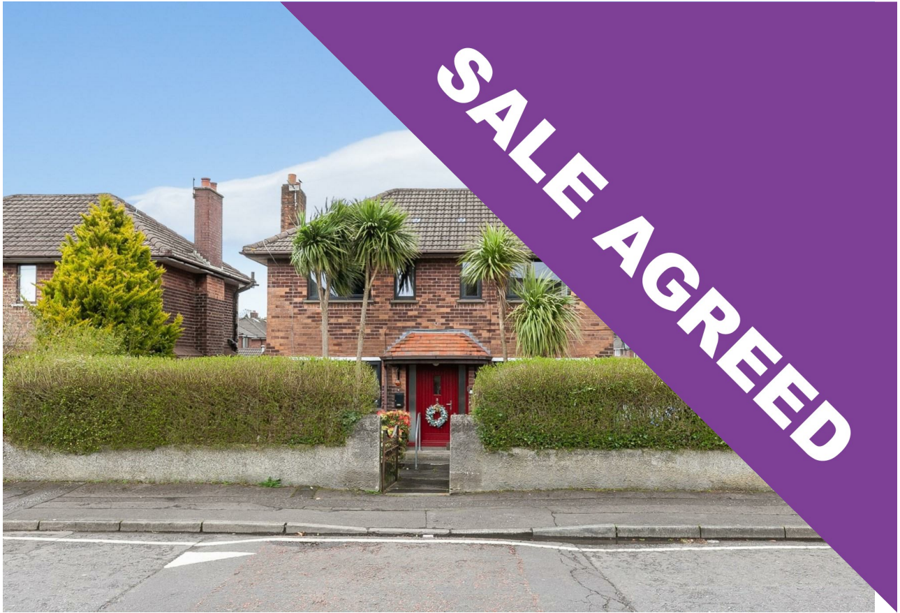
6 Glebe Road West, Newtownabbey, BT36 6EH