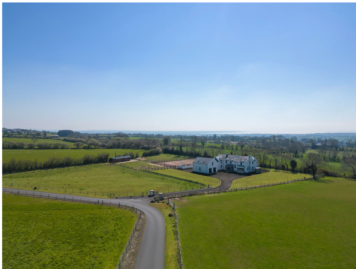
6 Eskylane Road, Antrim, BT41 2LL