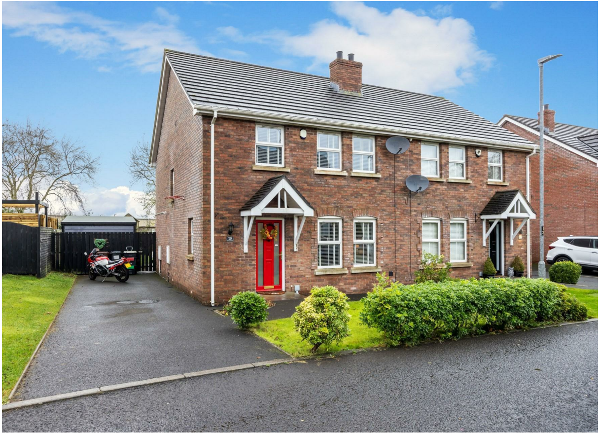
38 Dermont Crescent, Newtownabbey, BT36 4NZ