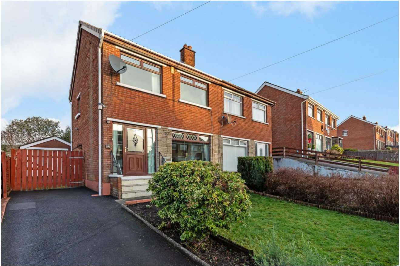
141 Burnthill Road, Newtownabbey, BT36 5HF