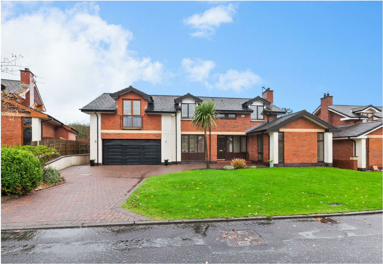
25 Briar Crescent, Newtownabbey, BT37 0FR