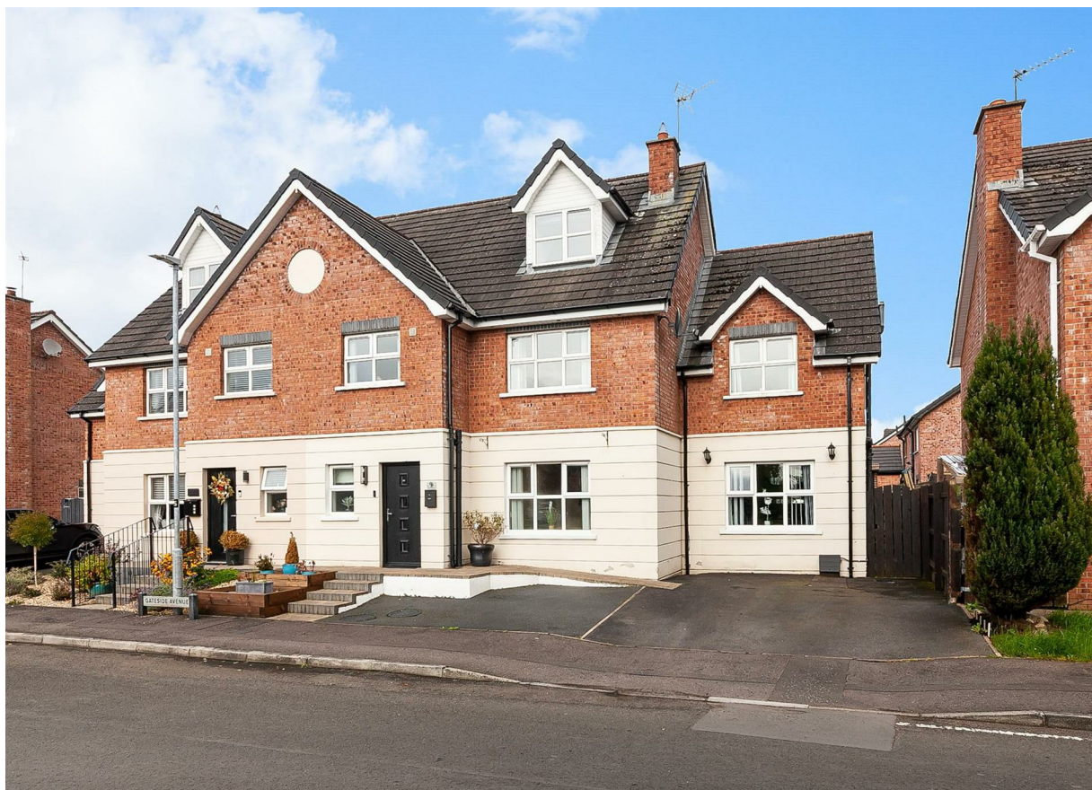
9 Gateside Avenue, Ballyclare, BT39 9GS