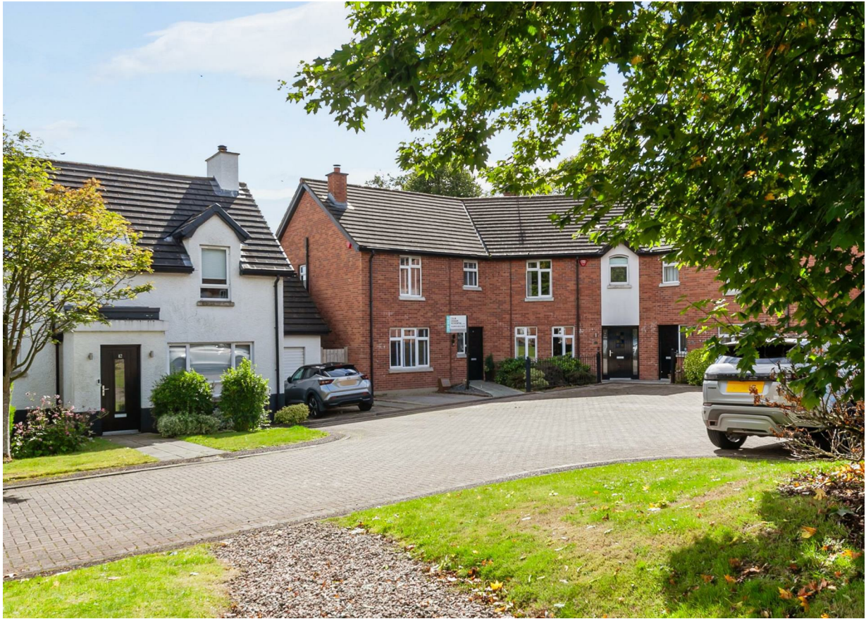
14 Ballyhamage, Doagh, BT39 0PZ