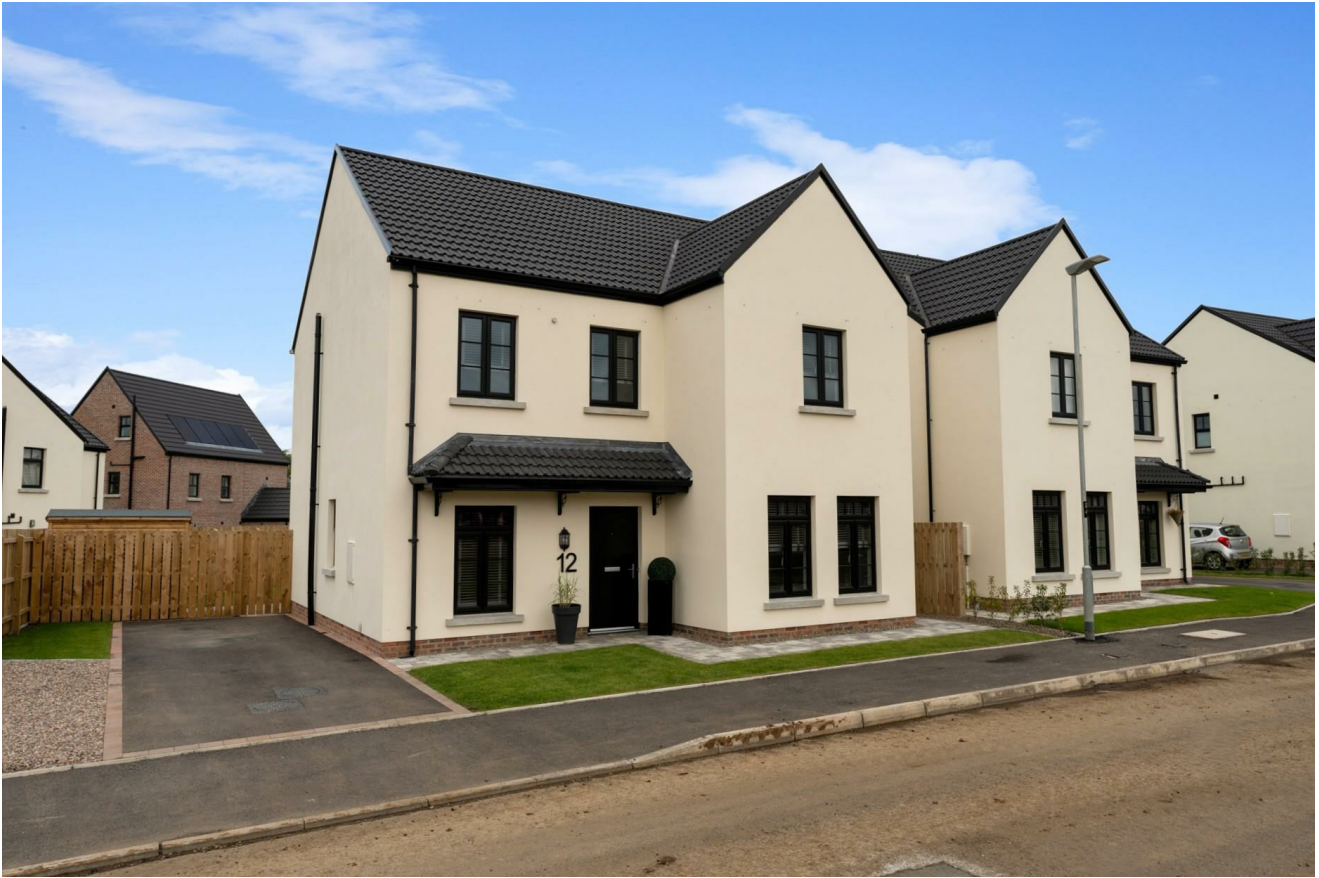
12 Cloughan View Crescent, Ballyclare, BT39 8AF