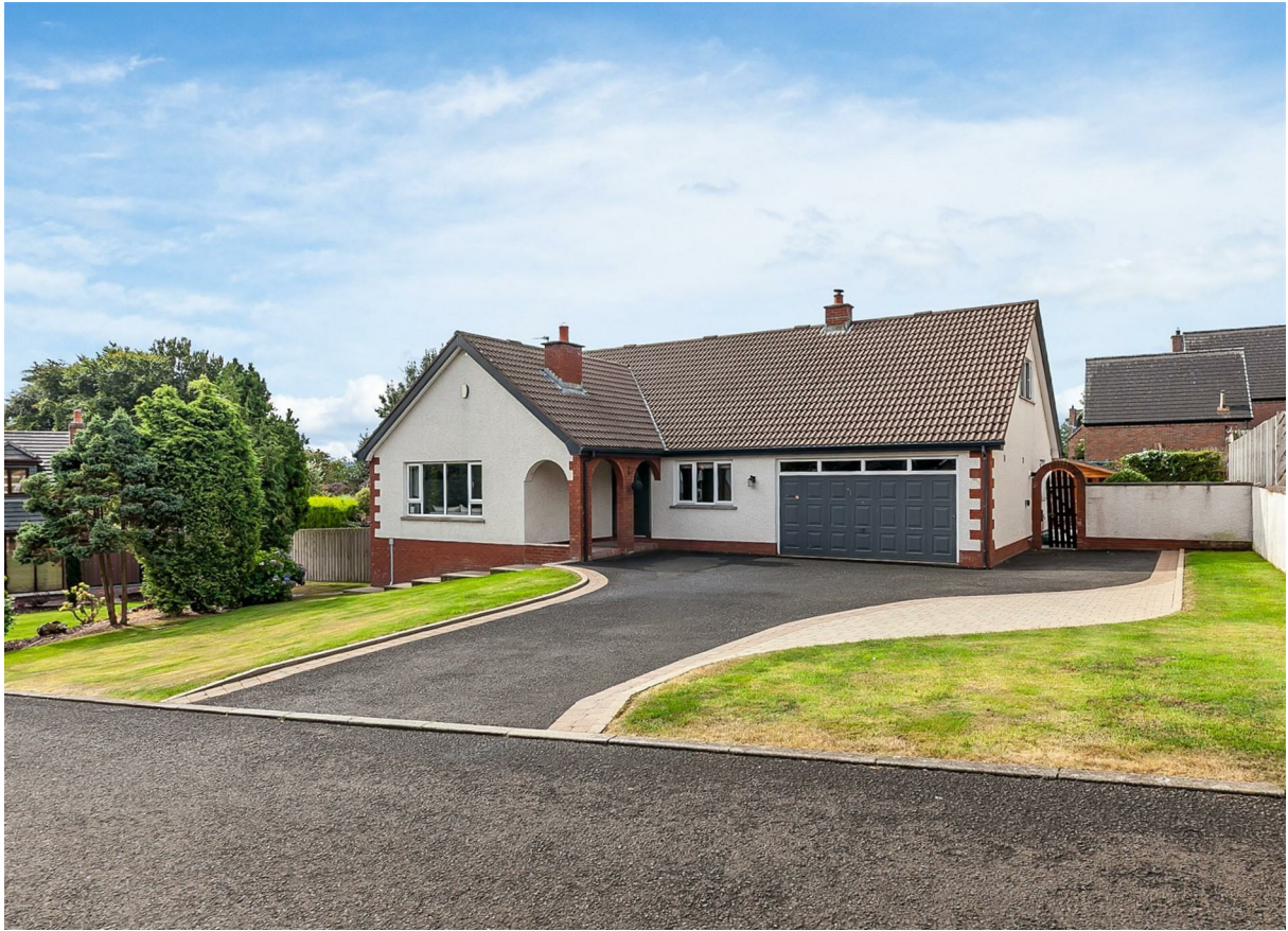
16 The Chase, Parkgate, BT39 0JT