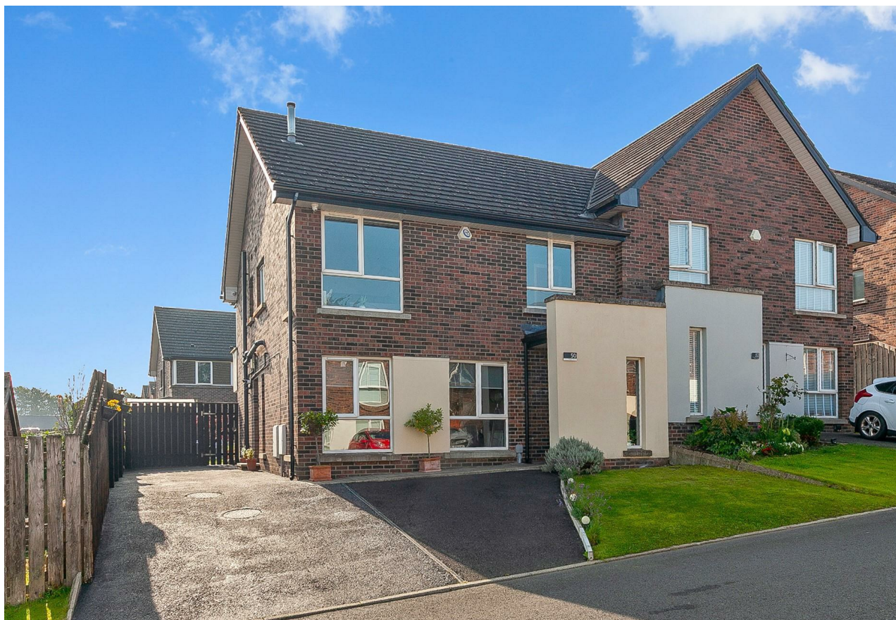
50 Rogan Wood, Newtownabbey, BT36 4BG