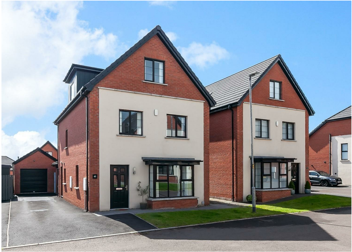
41 Highgrove Road, Carrickfergus, BT38 9AG